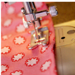
align presser foot with fabric

TIP: It is much easier to shirr around a finished garment than to finish off edges around shirring! Make sure you have finished edges wherever possible before starting shirring.