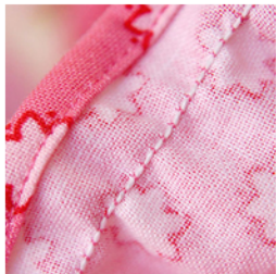
Example of a properly tensioned row of stitching. (underside of fabric)

Test your tension on a spare piece of the fabric you will be sewing on. Each machine is different, play with yours to find the right settings. What you want is to sew a section of shirring and have the fabric still stretch back to its original length without sliding along the shirring. If your tension is too tight, (or if you wound the elastic too tightly on the bobbin) your elastic thread will stretch too tightly when feeding out of the bobbin and your fabric will pull together too tightly.