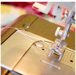
leave long tails

Start a row of stitches. You may draw yourself a guide with a ruler and chalk, but I find it easiest to just line up your presser foot with the edge of the fabric and let the fabric be your guide. Make sure you leave a long tail of elastic thread to tie off later. Forward and reverse stitch 3-4 times to anchor the elastic. If you don't, it can unravel easily.